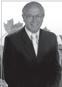
BEV SHIPLEY, MP LAMBTON-KENT-MIDDLESEX

Our Conservative Government is putting money back into the pockets of working Canadians with the Canada Employment Amount. Most Canadian employees, excluding the self-employed, will qualify for a tax credit on up to $1,061 in 2011. Our Conservative Government is making it easier for Canadians to keep the returns from their hard work.